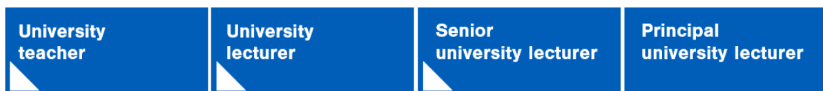
Figure 1. Overview of the lecturer career system.

The Aalto lecturer career system consists of four levels: university teacher, university lecturer, senior university lecturer, and principal university lecturer (see Figure 1.).